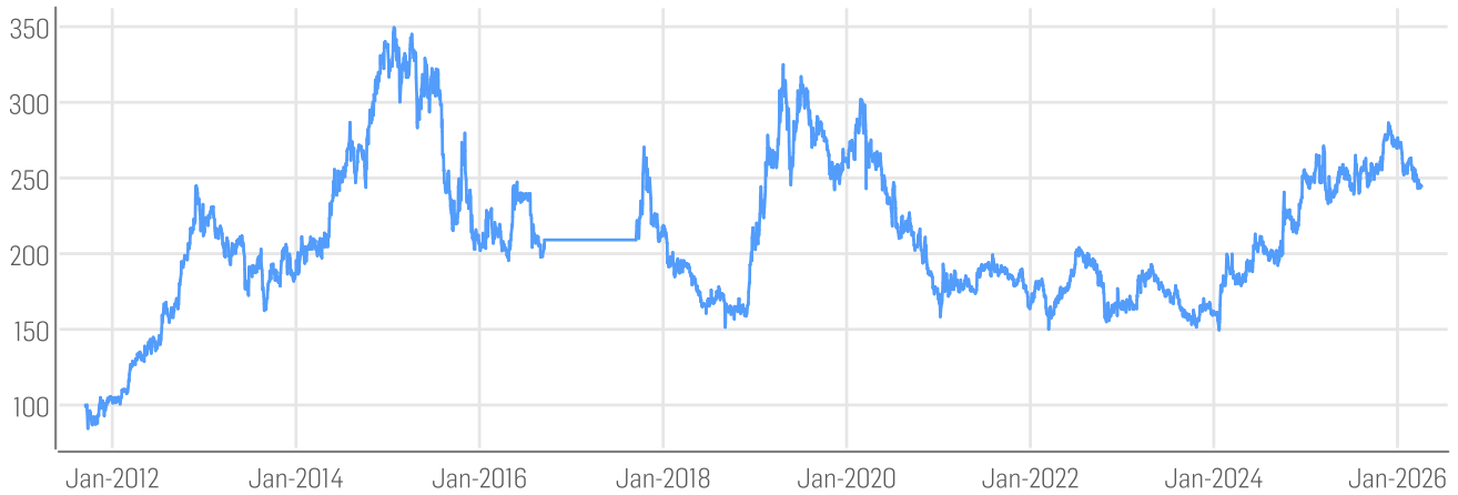
■ GPR GLI Emerging Markets Communications Infrastructure AUD Index GTR