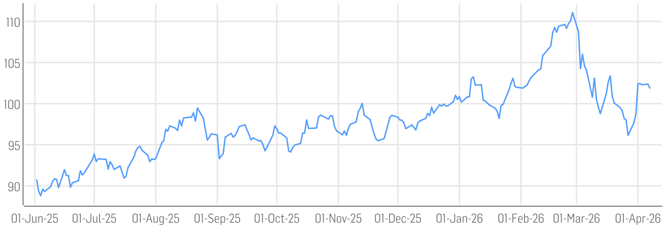
■ GPR 250 BNP Paribas Adapted Daily Net 15% Europe Retail USD Index NTR