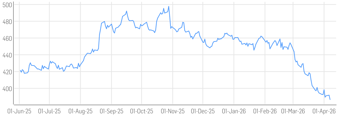
■ GPR 250 BNP Paribas Adapted Daily Net 15% Asia Residential USD Index NTR