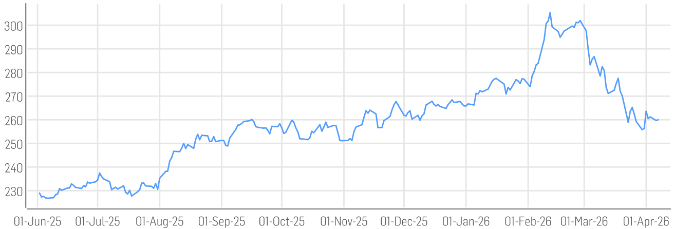
■ GPR 250 BNP Paribas Adapted Daily Net 15% Asia Diversified USD Index NTR