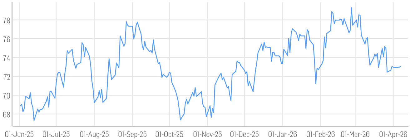
■ GPR 250 BNP Paribas Adapted Daily Net 15% Americas Hotel USD Index NTR