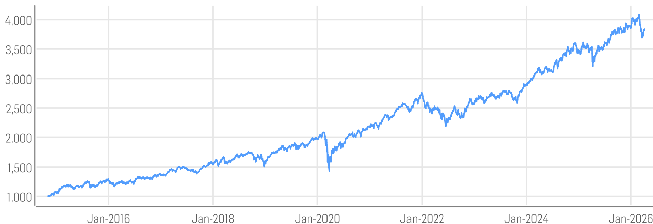
■ Solactive Wealthsimple North America Socially Responsible Factor Index NTR