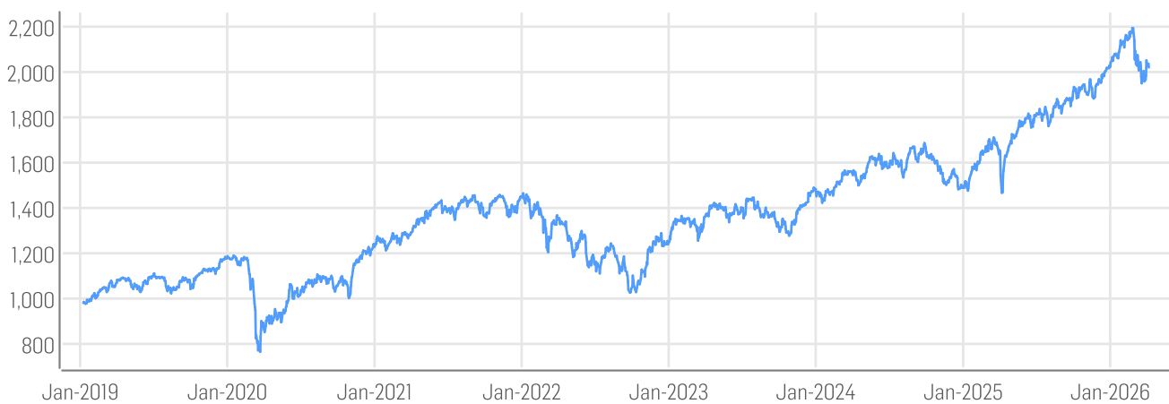
■ Solactive GBS Developed Markets Europe ex Germany Large & Mid Cap USD Index NTR