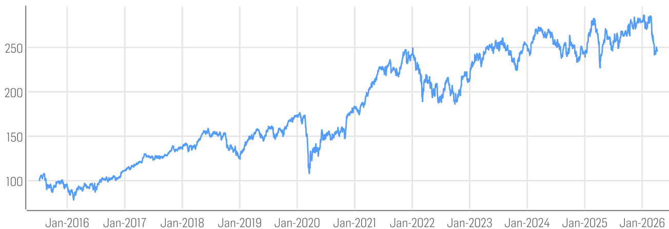
■ Solactive Family-Owned Businesses Select Index NTR