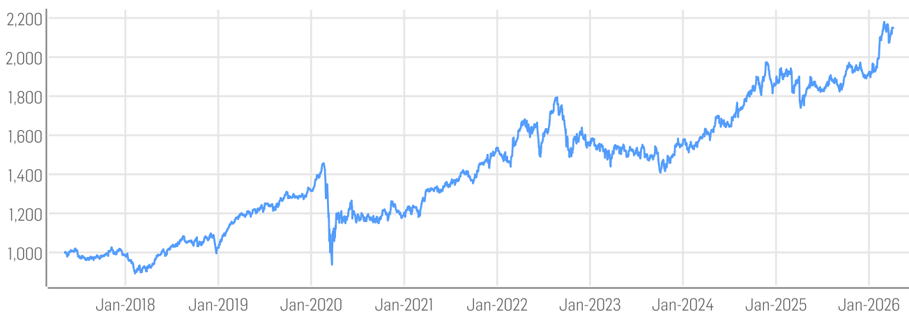
■ Solactive GBS Developed Markets Investable Universe Core Infrastructure DKK Index TR