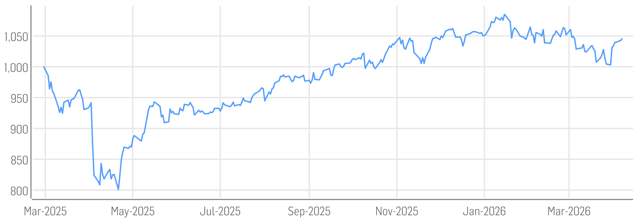
■ Solactive Invesco Developed Markets Multifactor Enhanced CHF Index PR