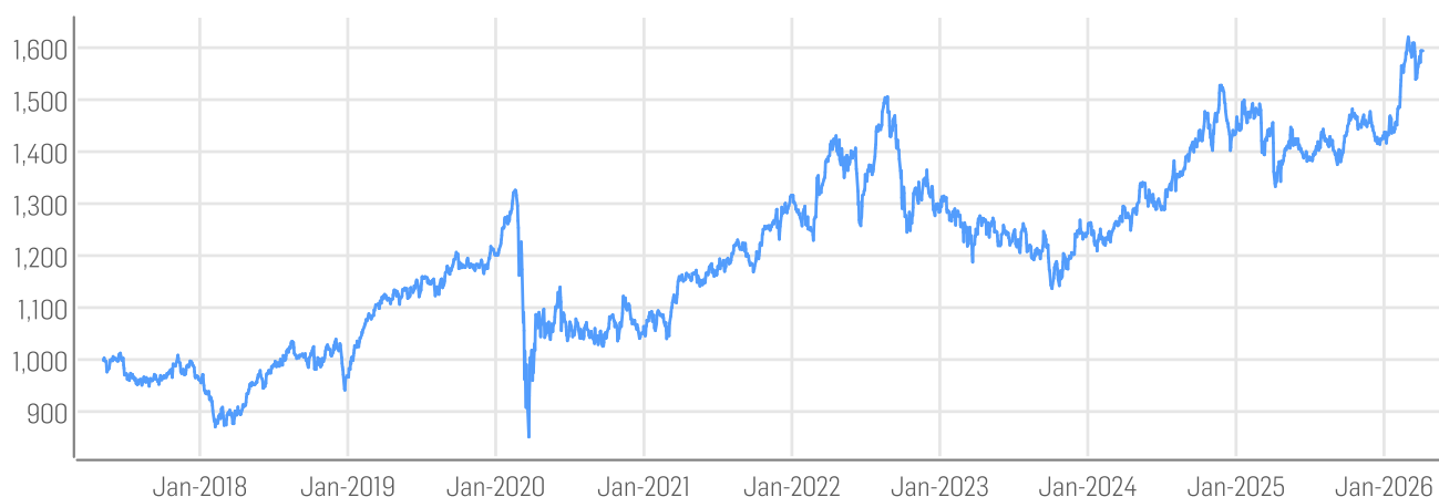
■ Solactive GBS Developed Markets Investable Universe Core Infrastructure DKK Index PR