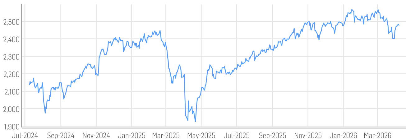
■ Solactive GBS Developed Markets ex Eurozone All Cap EUR Index NTR