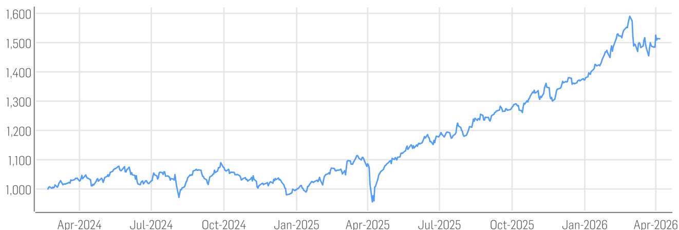
■ Solactive Pacer Developed Markets International Cash Cows 100 Index NTR