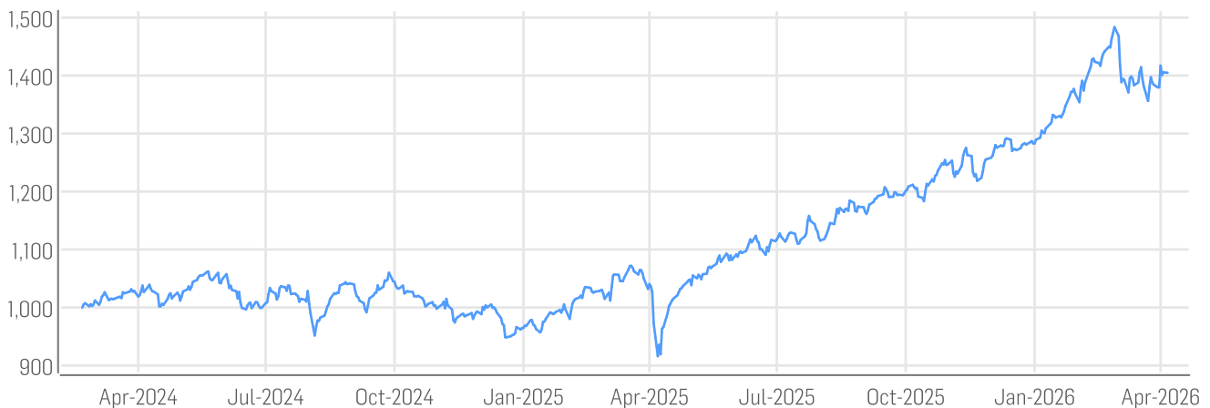
■ Solactive Pacer Developed Markets International Cash Cows 100 Index PR