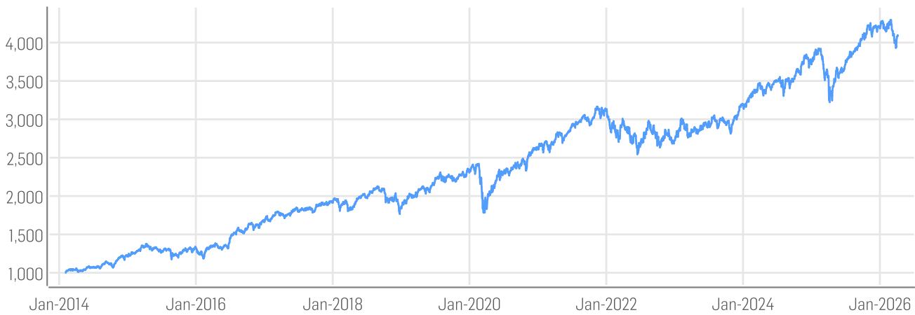
■ Solactive USS Developed Markets Ethically Screened Climate Tilted Index NTR