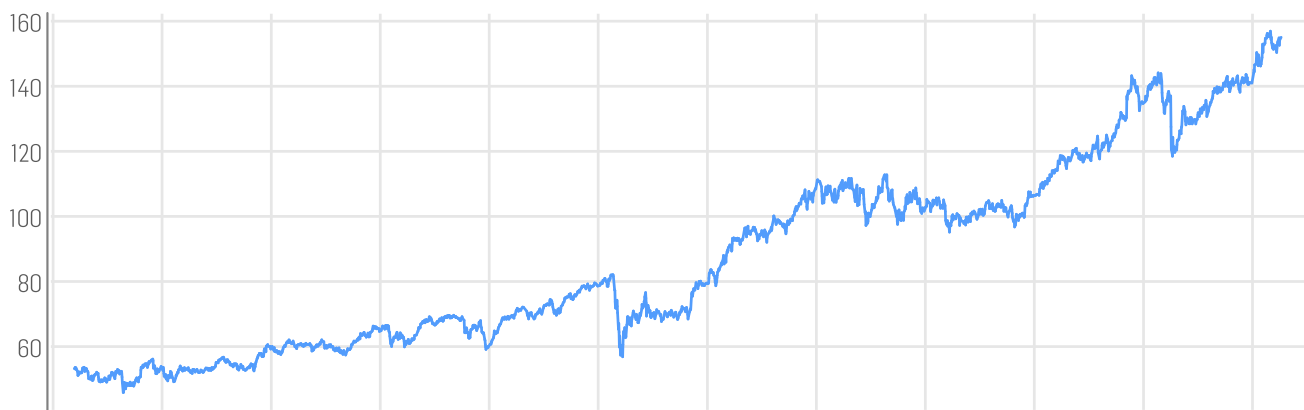
■ BÖRSE ONLINE Globale Dividenden-Stars Index