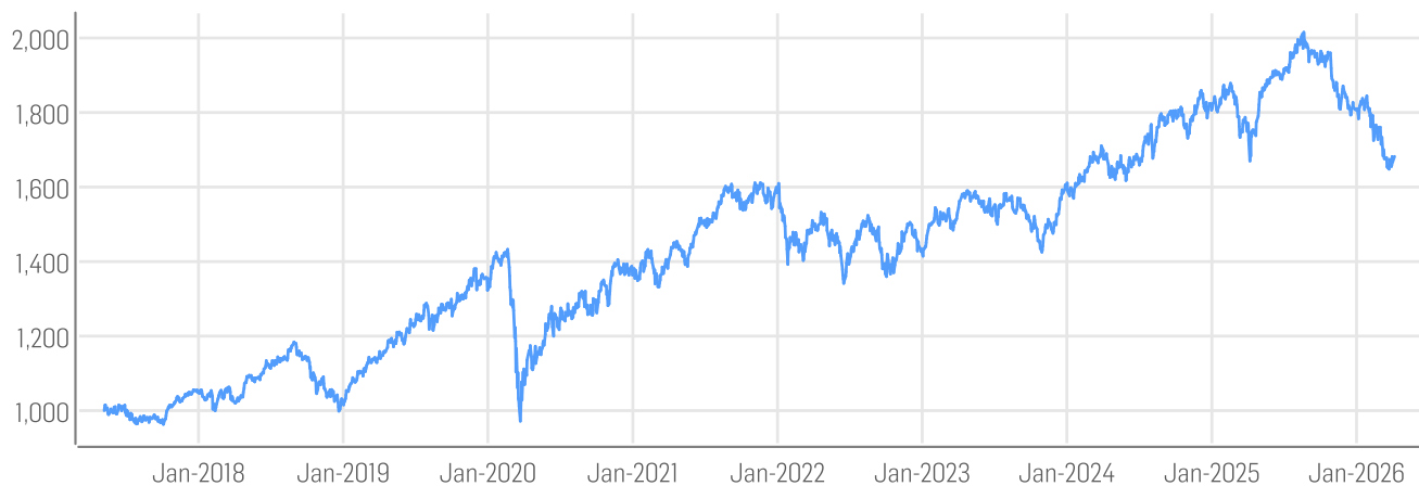
■ Solactive Australia ex Financials Materials and Energy Capped Index NTR