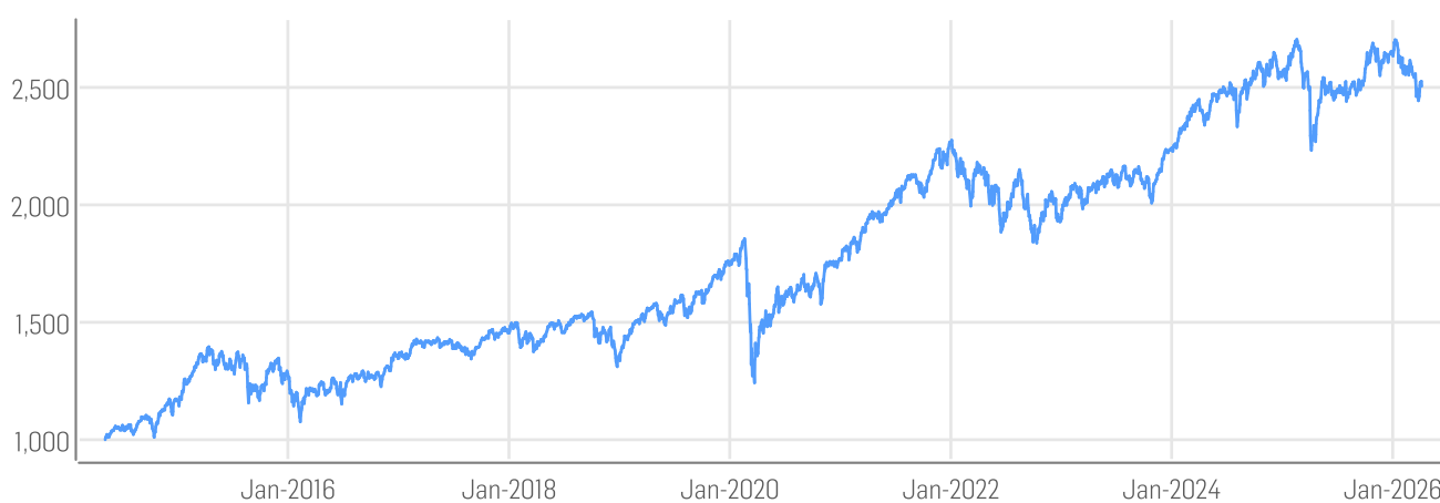
■ Munich Re ESG Optimized Global Developed Conservative Equities Index PR