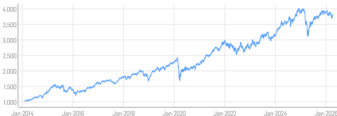
■ Solactive Developed Markets ISS ESG SDG Climate Focus SEK Index PR