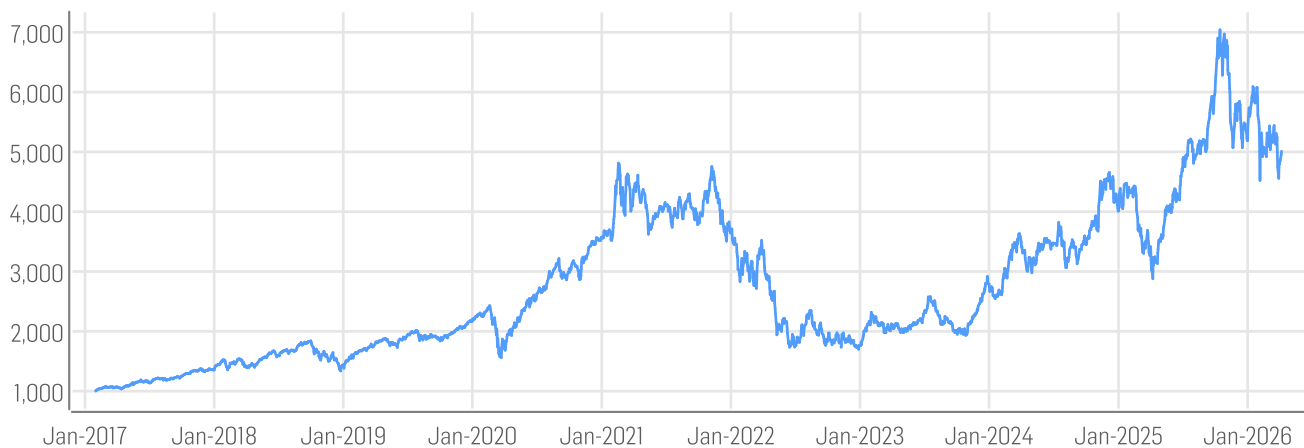
■ Solactive Global Digital Payment Technology Index NTR