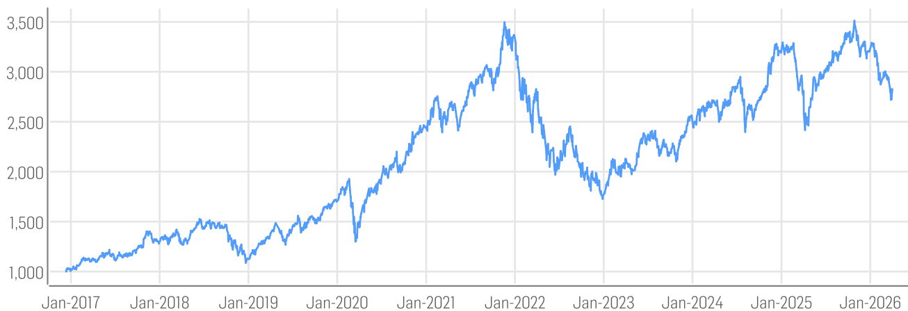
■ Solactive Metaverse Leaders EUR Index Decrement 5%