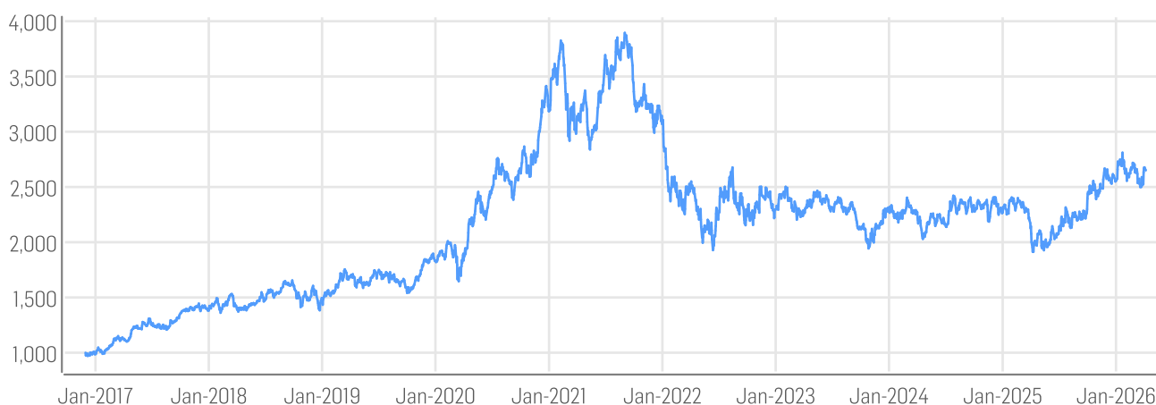
■ Solactive Global Genomics Immunology and Medical Revolution CAD Index PR