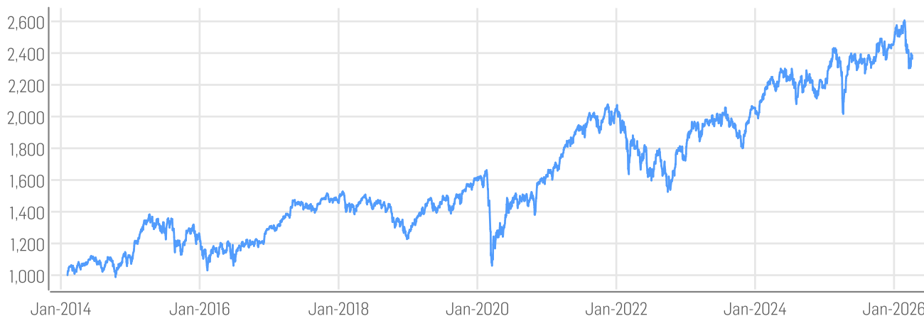
■ Solactive ISS ESG Developed Markets Eurozone Net Zero Pathway Index NTR