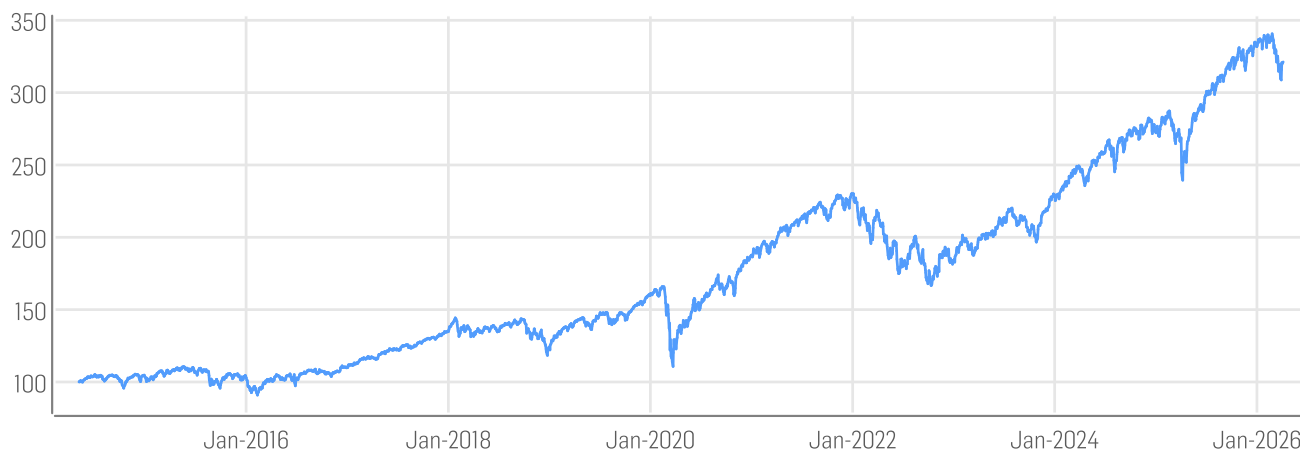
■ Solactive TRSP L&G Targeted SDG Enhancement Developed Equity USD Index NTR