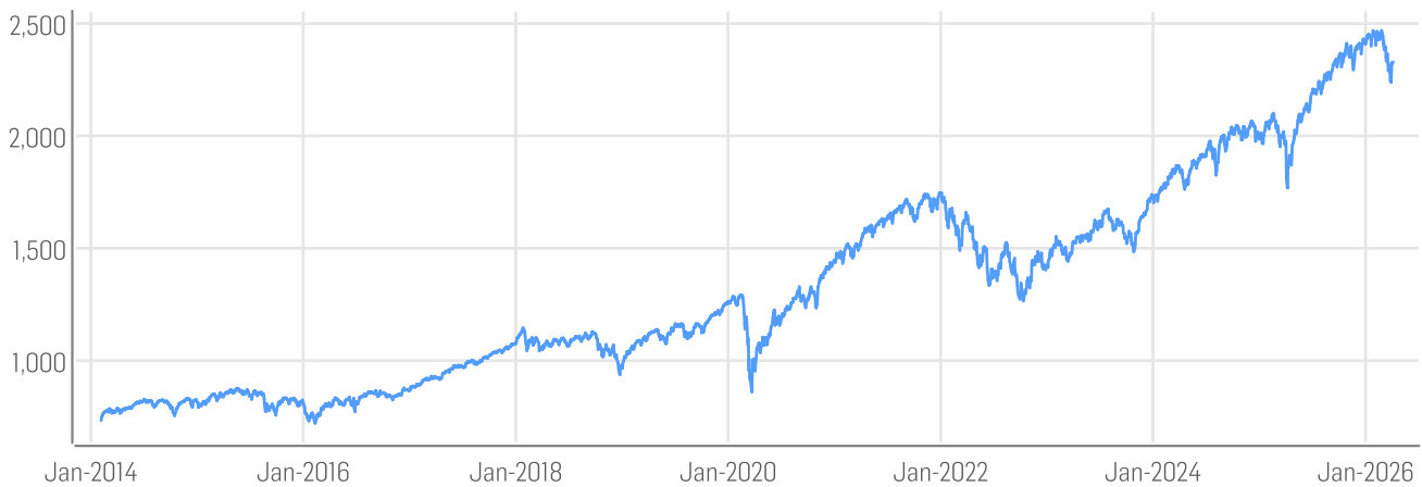
■ Solactive ISS ESG Developed Markets Climate Transition Benchmark USD Index NTR