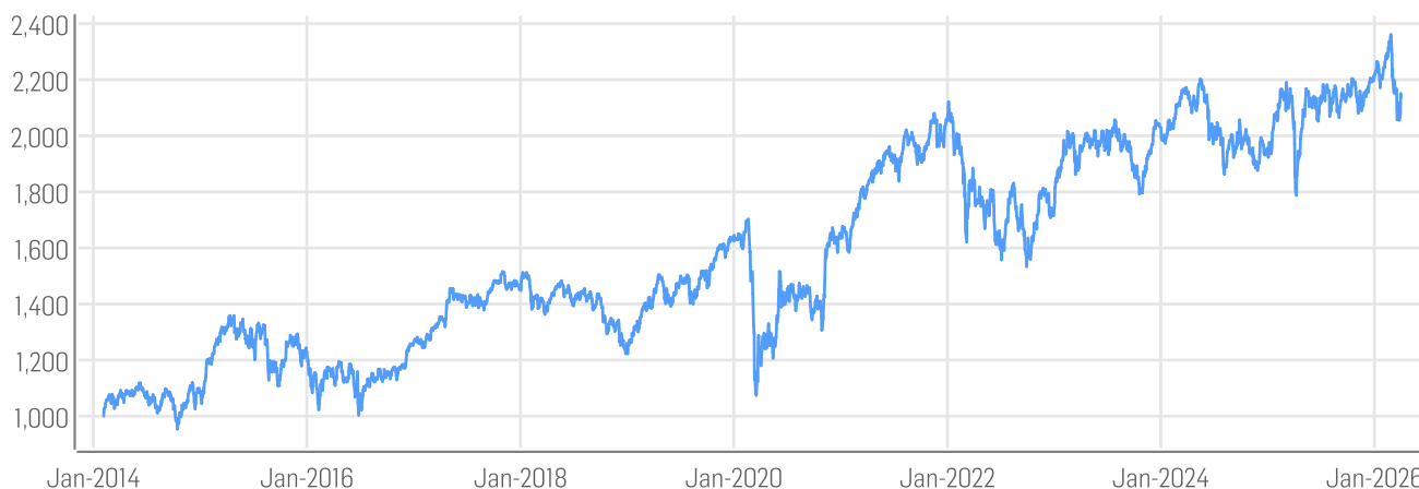
■ Solactive Ethique Independance et Gouvernance Responsable France 30 PR