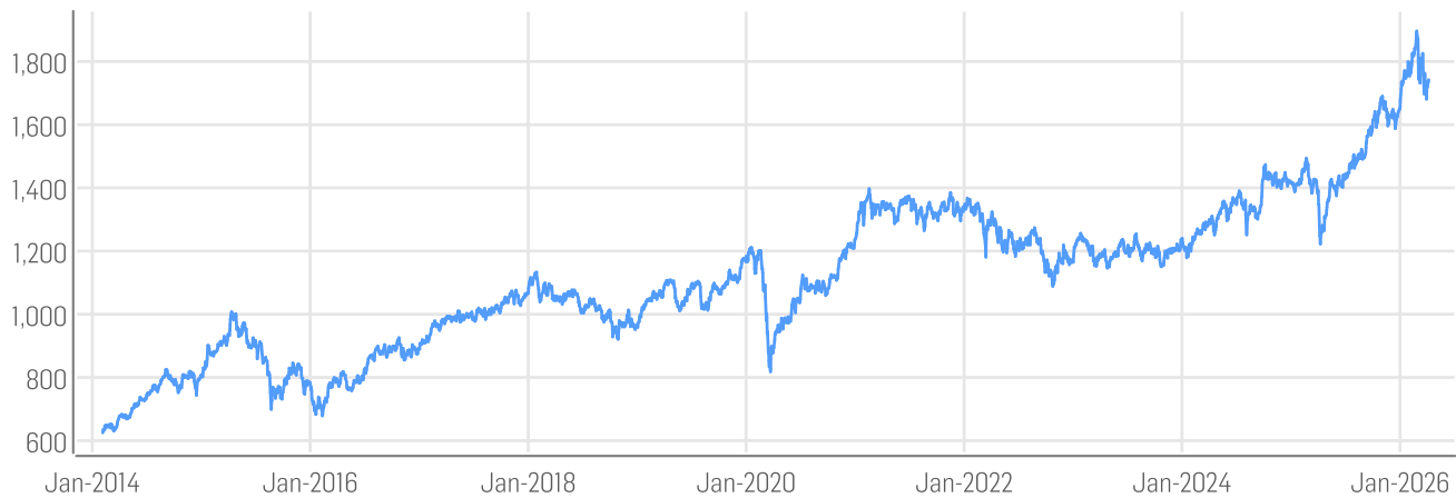
■ Solactive ISS ESG Emerging Markets Climate Transition Benchmark Index NTR