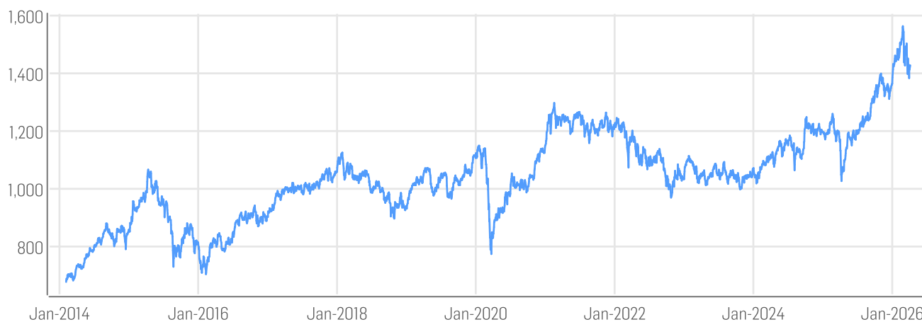
■ Solactive ISS ESG Emerging Markets Climate Transition Benchmark Index PR