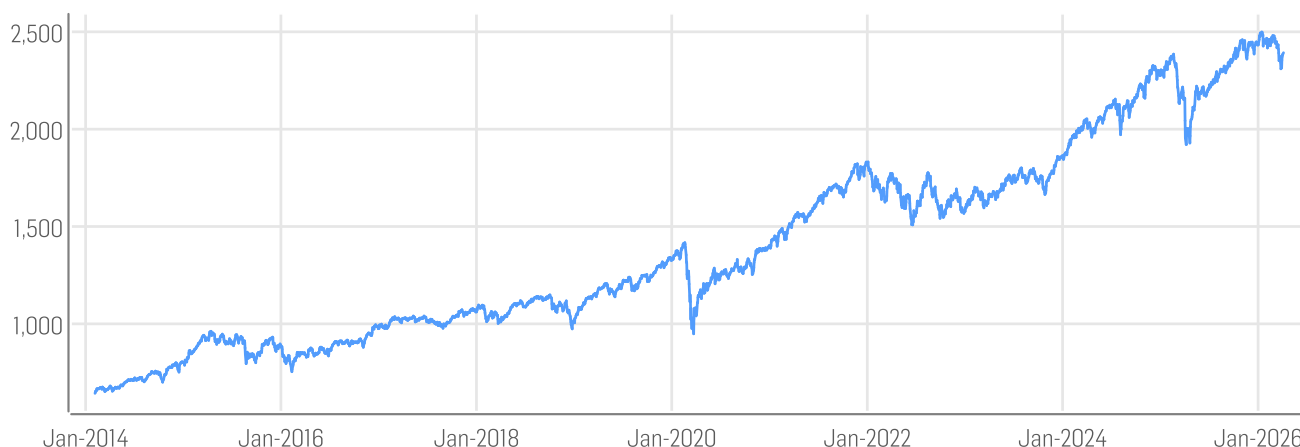
■ Solactive ISS ESG Developed Markets Climate Transition Benchmark Index NTR