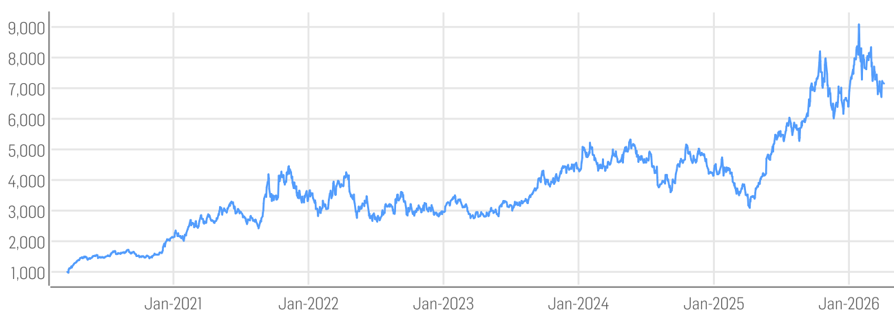
■ Solactive United States Uranium and Nuclear Energy ETF Select Index NTR